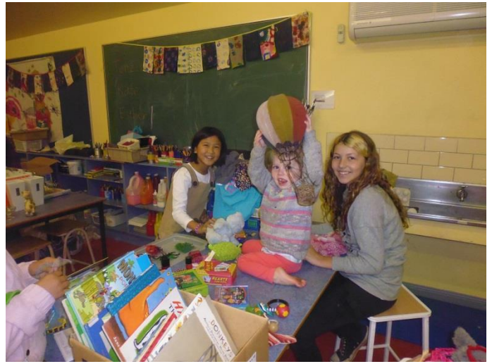
Lots of fun was had by all at our Trash and Treasure Fund day.

We have 4 clubs sessions for this term. The children have brainstormed some ideas for activities. We don't need to do all of them each week. If there is something on the list you feel you could help out with, please let me know. (Note this list was compiled by the students) Sport. Woodwork. Clay. Drama. Sky-diving. Knitting. Weaving. Writing. Cooking. Bush walking. Gold panning. Maths games. Science. Kite making and flying. Working on the eco-cubby.