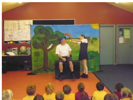
Bully No More Performance